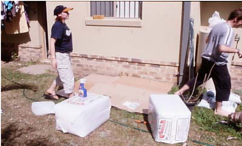
Cover the ground with cardboard