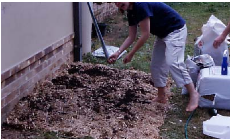
Preparing the no-dig bed