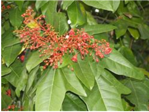
Brachychiton acerifolius Dicotyledon