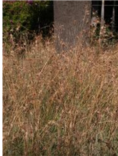
Themeda trianda Kangaroo Grass Monocotyledon