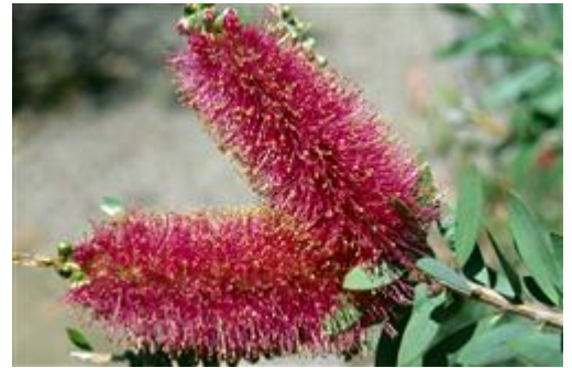
Callistemon violaceus Myrtaceae

You should be able to tell a family name from other types of names by the fact that it will end with "aceae". Genus names do not end in aceae.