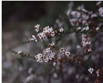
Astartea heteranthera Myrtaceae