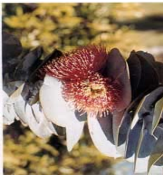
Eucalyptus macrocarpa Myrtaceae